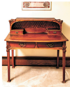
French Art Nouveau Walnut Desk Majorelle, Inlaid and floral carved, Early 20th Century