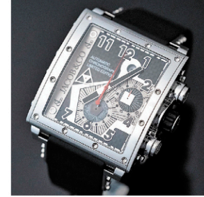
Jacob & Co. Rare Epic 1 V2 Stainless Steel Automatic Chronograph Wristwatch with skeleton back