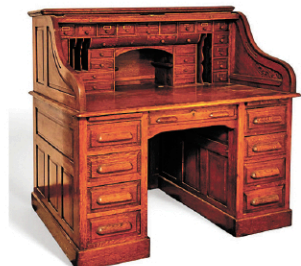
Antique Victorian Oak S Roll Top Raised Panel Desk, Early 20th Century