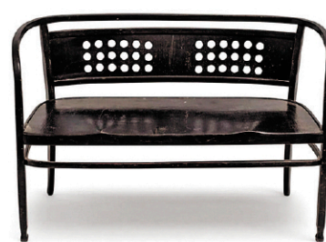
Otto Wagner & J&J Kohn Vienna Secession Sofa Model No. 721, Jugendstil Signed circa 1902