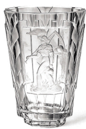
Fine Acid Etched Signed Art Deco Crystal Vase, 1938