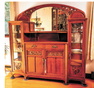
Gauthier-Poinsignon Art Nouveau School of Nancy, Vine Carved Server Buffet, circa 1900