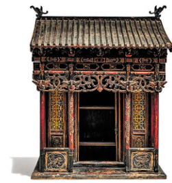
Monumental 47in 19th Century Chinese Qing Dynasty Ancestral Shrine with Gilt Dragons