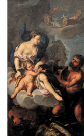
Charles-Antoine Coypel Signed Oil on Canvas Painting, 18th Century