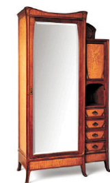
Au Nouveau Lyon signed French Art Nouveau Wardrobe with Mirror