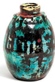
Pierre-Adrien Dalpayrat Art Nouveau Glazed Stoneware Vase, Signed, Early 20th Century