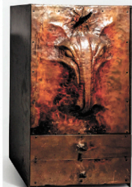
Alain Aparicio Hammered Copper Sculpted Unicorn Cabinet, Late 20th Century