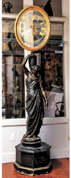
Mathurin Moreau Sculpture Store Mystery Clock Salesroom Model #245 for Val d'Osne, 19th Century