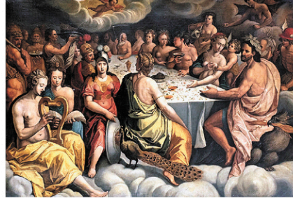
Monumental Crispin van den Broeck, "The Feast of the Gods at the Wedding of Peleus and Thetis", 16th Century Oil on Canvas Painting