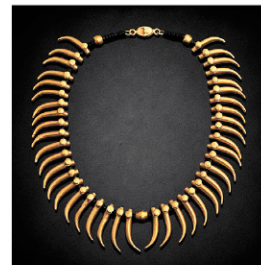
Important Rare Pre-Columbian Tairona/Quimbaya High Carat Gold Necklace about 1500 years old