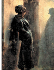
Joseph Stella Signed "The Dreamer" pastel and watercolor Painting on Paper