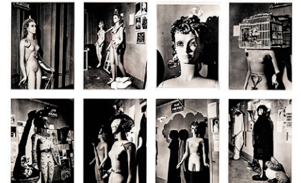
Man Ray 8 vintage gelatin silver photographic prints, 1938