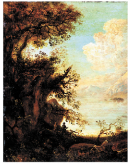
Asher B. Durand Signed Hudson River School Oil on Panel Painting