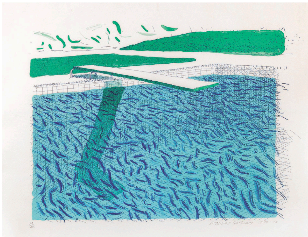
David Hockney, Lithographic Water Made of Lines, Crayon and Blue Wash , 1978-80 Estimate $80,000-120,000