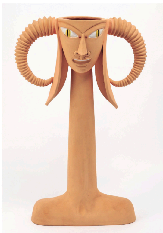
Jean Cocteau, Grand Chèvre-cou Partially painted and glazed pink ceramic vase, 1958 Estate of James Fisher Estimate $15,000-25,000