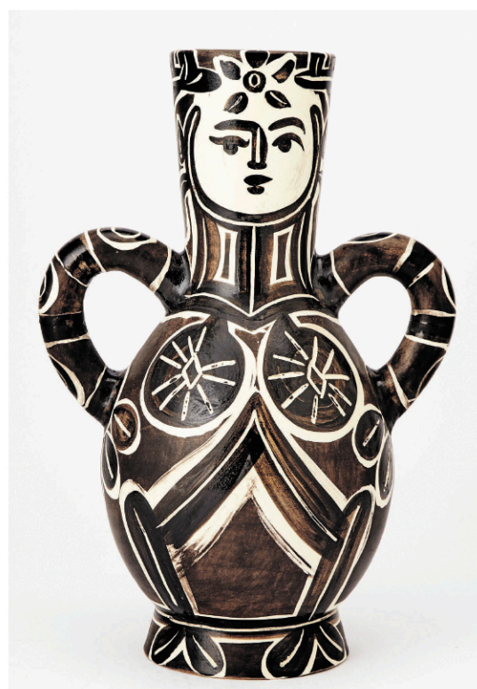
Pablo Picasso, Vase deux anses hautes Painted and partially glazed white ceramic vase, 1953 Estate of Edouard Bruyne Estimate $25,000-35,000