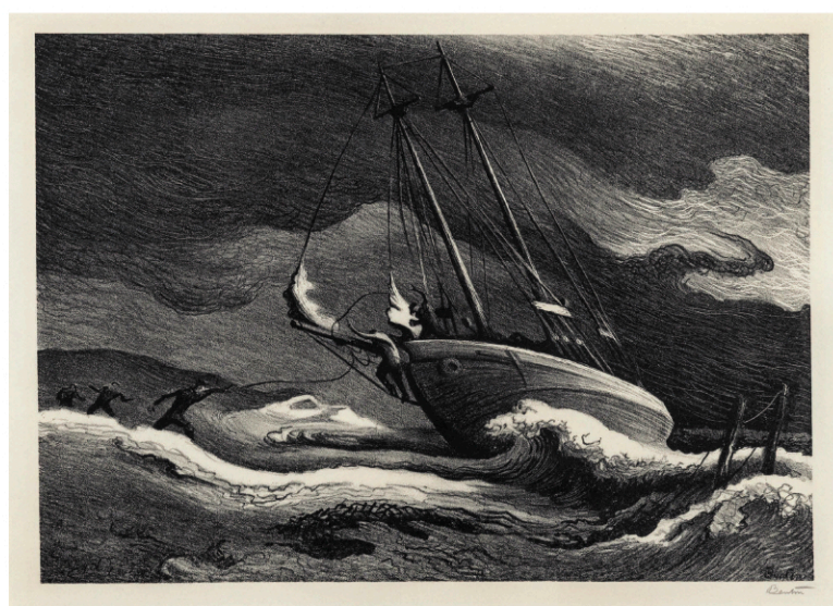
Thomas Hart Benton, After the Blow , Lithograph, 1946 Estimate $3,000-5,000