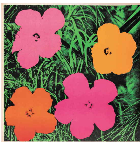
Andy Warhol, Flowers , Color offset lithograph, 1964 Estimate $20,000-30,000