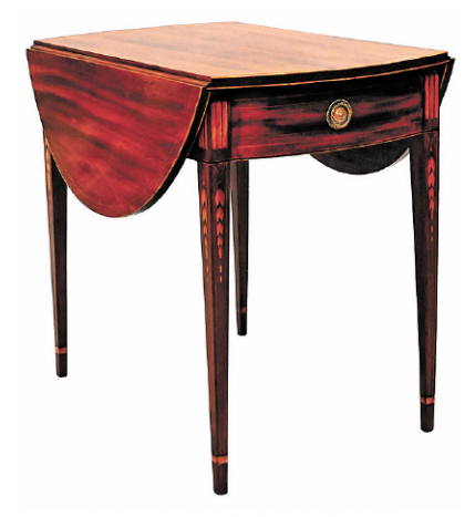
Federal Inlaid, Ht. 28", Wd. 19"