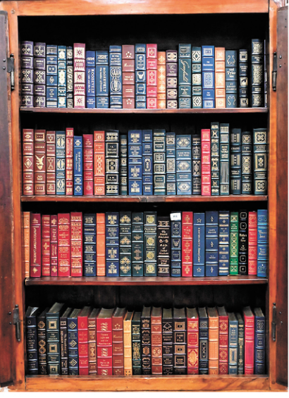
Easton Pess Part of Book Collection