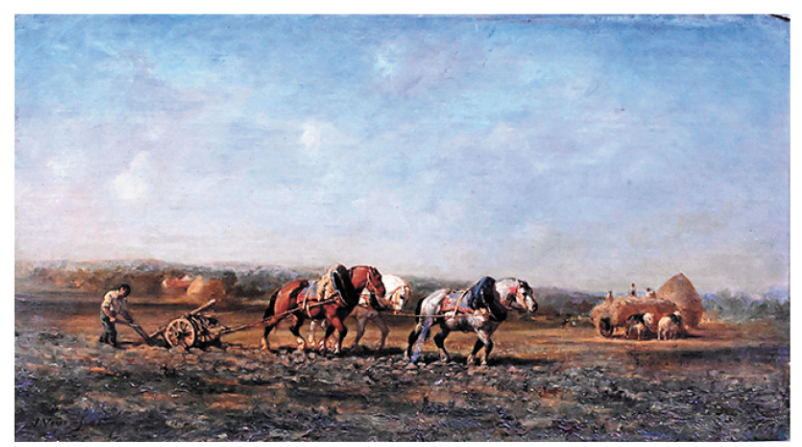
Jules Vegrassat, Oil on Canvas, 10" x 18"