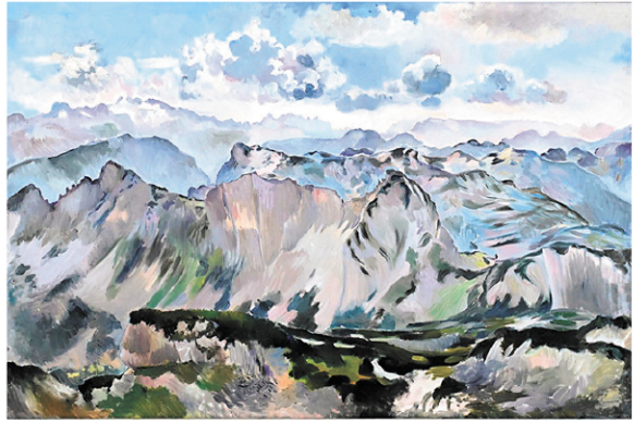
Edith Kramer, 28" x 42"