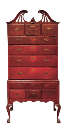
18th C. Chapin School Ht. 80″, Wd. 35″