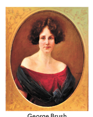
George Brush Oil, 25″ x 18″