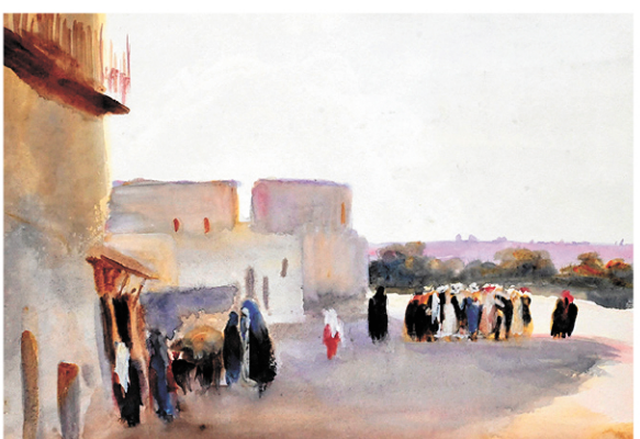
Emily Sargentt Watercolor, 1 of 3