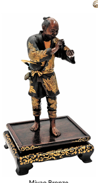
Miyao Bronze Ht. 10 ½", 1 of 2