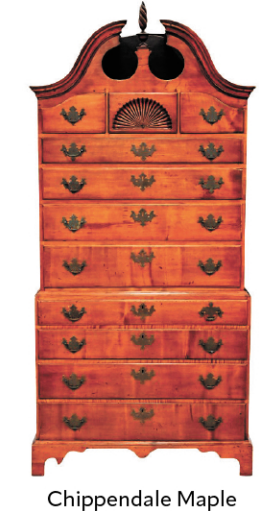
18th Century, Ht. 70"