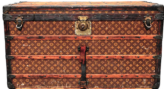
Louis Vuitton Ht. 22", Wd. 39"