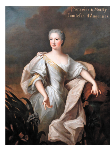
Jean-Marc Nattier Oil on Canvas, 57" x 44"