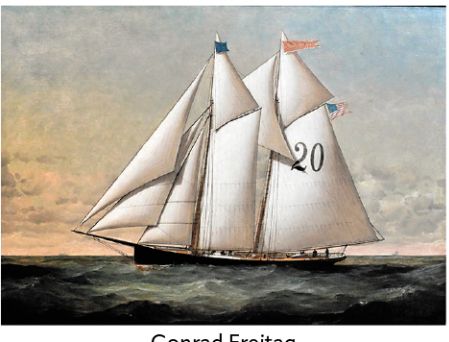
Conrad Freitag Oil on Canvas 26" x 36"