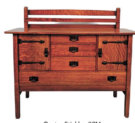
Gustav Stickley #814