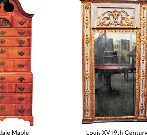
Louis XV 19th Century Ht. 84"