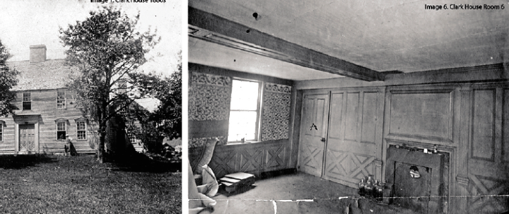
1737 Joel Clark House – Interior, 1 of 9 rooms