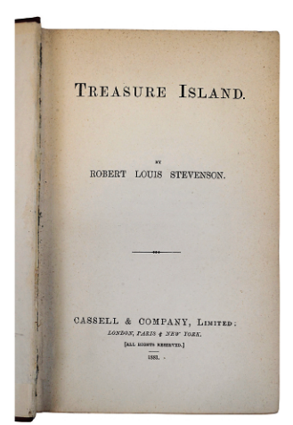
First Edition Treasure Island Part of Book Collection