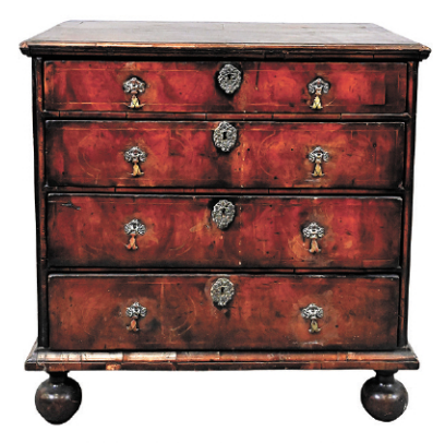
William Mary Figured Walnut, Wd. 32