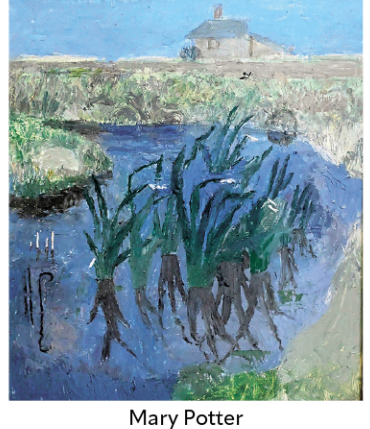
Oil on Canvas 15" x 11", 1 of 3