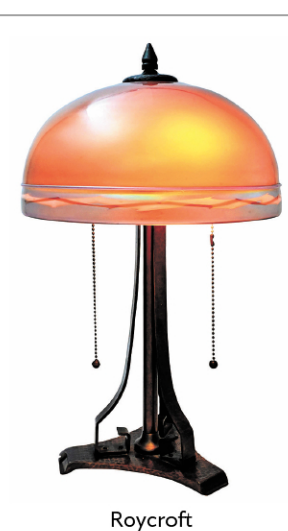
Ht. 16", Dia. 10"