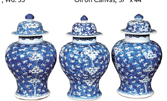
Porcelain, Ht.17 (Chinese)