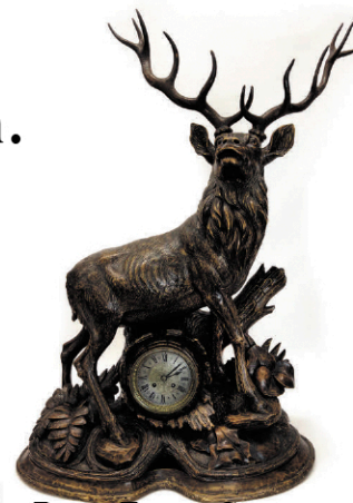
BLACK FOREST CARVED STAG CLOCK, 37"