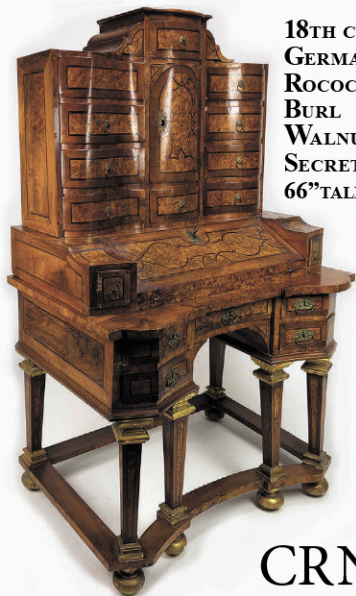
18TH C. GERMAN ROCOCO BURL WALNUT SECRETARY 66" TALL