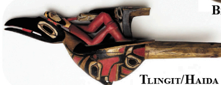
TLINGIT/HAIDA NORTHWEST COAST RAVEN RATTLE