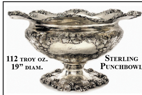
112 TROY OZ. 19" DIAM.