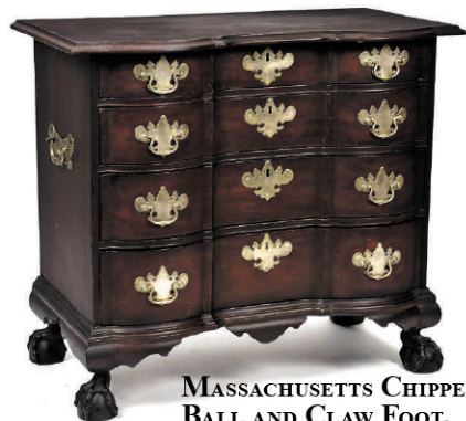
MASSACHUSETTS CHIPPENDALE BALL AND CLAW FOOT, BLOCK-FRONT CHEST, CASE 33"W