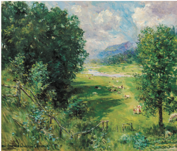
Howard Chandler Christy (1872-1952) 'Valley View'