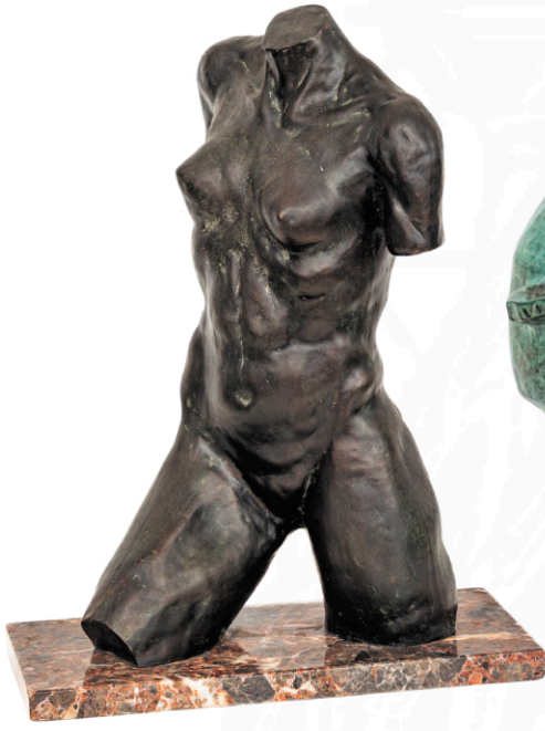
Auguste Rodin (1840-1917) 'Torse Féminin Debout'