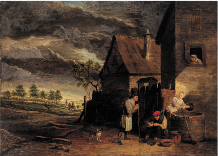
In the Manner of David Teniers the Younger (1610-1690) 'Village Scene With A Man Eating Mussels'