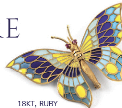
18KT, RUBY AND ENAMEL