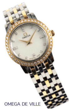
OMEGA DE VILLE