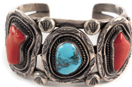
NAVAJO SILVER, TURQUOISE AND CORAL

Online-only with live Internet, phone and absentee bidding. Preview April 13 + by appointment