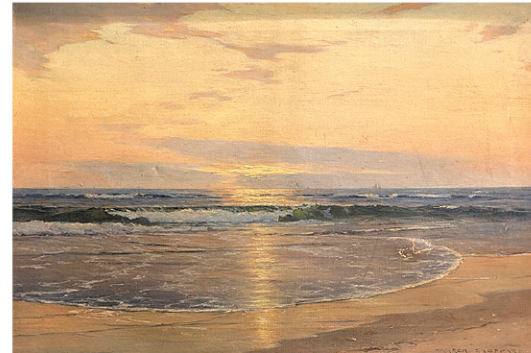
Lot 136 - Warren Sheppard, "Beach Scene"