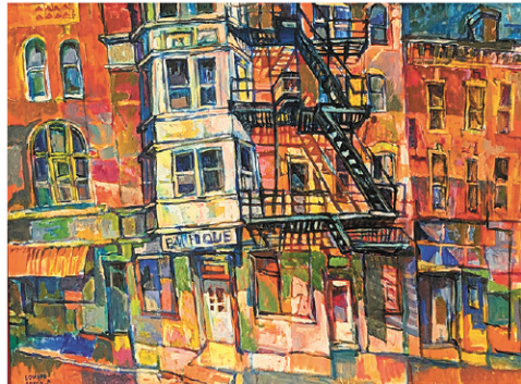
Lot 140 - Edward Loper Jr., "Fire Escapes"