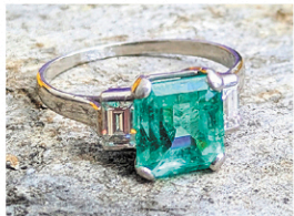
Lot 59 - AGL Certified Colombian Emerald Ring