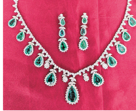
Lot 60 - 74 Carat Emerald Necklace and Earring Set