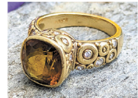
Lot 118 - Alex Sepkus Ring