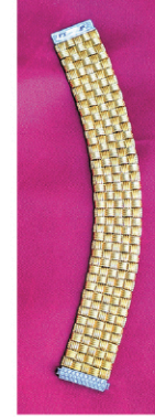
Lot 15 - Roberto Coin Bracelet