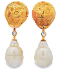
Lot 61 - Henry Dunay Earrings