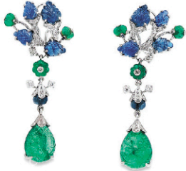
Lot 55- Tutti-Frutti Earrings

Online bidding at liveauctioneers and bidsquare • Bid in-person on-site, by phone or left bids accepted