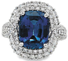
Lot 63 - Sapphire and Diamond Ring