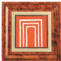
112: After Josef Albers Abstract Geometric Painting