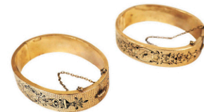
265: Victorian Gold & Black Tracery Bangle Bracelets, 2