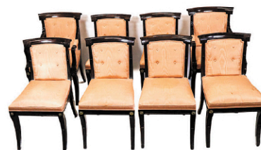
336: Set of 8 Regency Mahogany Dining Chairs