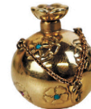
262: Gold, Turquoise and Ruby Perfume Pendant