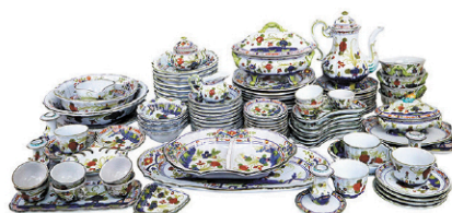
34: CACF Faenza "Garofano" Ceramic Dinner Set, 106