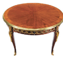
4: Louis XV Round Extension Dining Table