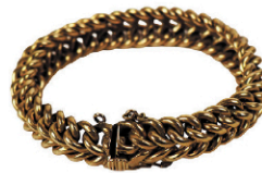
260: Gold Woven Bracelet