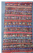
294: Oriental Silk Carpet