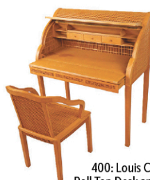
400: Louis Cane Roll Top Desk and Chair