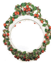
160: Italian Porcelain Mirror with Cherries