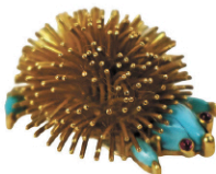
256: Van Cleef & Arpels Gold & Turquoise Porcupine Clip