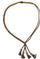
259: Gold Rope and Tassel Necklace