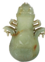
300: Chinese Carved Jade Covered Vase