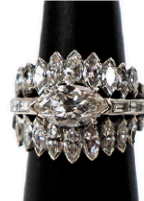
275: Van Cleef & Arpels Diamond Ring