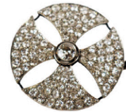
269: Pave-Set Diamond Brooch

150 School Street, Glen Cove, NY 11542 (2 Dosoris Way - for GPS)