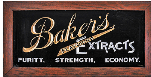
Baker's Extracts Store Advertising Sign