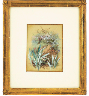
Fidelia Bridges (AM 1834-1923)