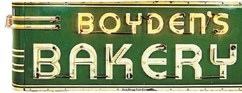
Circa 1940 Neon "Boyden's Bakery" Sign