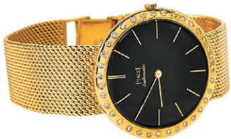
18k Piaget Diamond Wristwatch