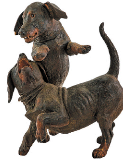
Black Forest Figural Group attributed to Walter Mader