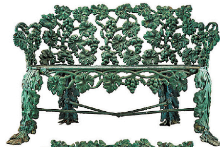
Pair Victorian Cast Iron Garden Benches