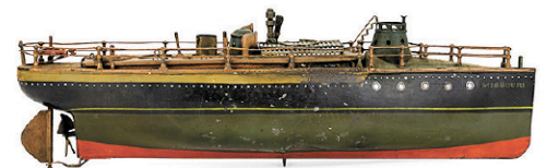
Missouri Marklin Torpedo Live Steam Boat