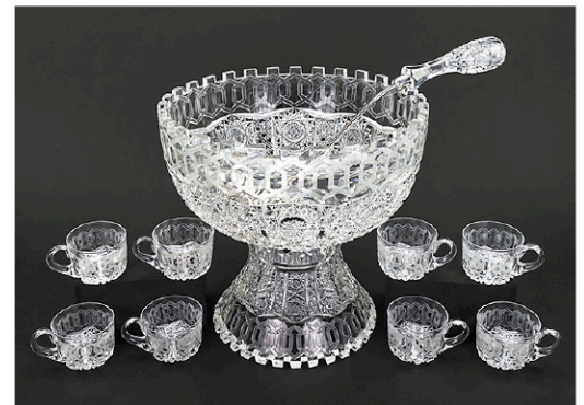
ABCG Alhambra Punch Set

Merrill's Auctioneers and Appraisers is pleased to offer Country & Victorian furniture, paintings & prints from all eras including Vermont artists. Artist signed bronzes, sterling silver, jewelry, fine glass & china. Asian accessories wrought iron garden furniture and accessories, and much more.