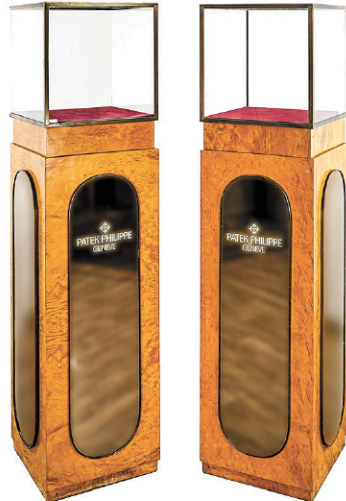
Pair MCM Patek Philippe Display Cabinets