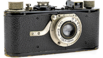
Leica Model IA Close-Focus Camera