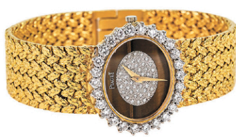
18k Piaget, Diamond & Tiger-eye Wristwatch