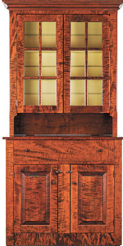
Tiger Maple Stepback Cupboard