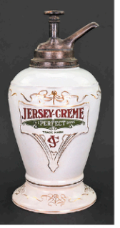
Jersey-Crème Soda Fountain Dispenser