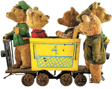
Large 1950's Teddy Bear Trolley Window Display