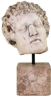
Ancient Marble Bust of Alexander

FRIDAY, MAY 29, 2026 MERRILL'S AUCTION GALLERY 137 JAMES BROWN DRIVE, WILLISTON, VERMONT