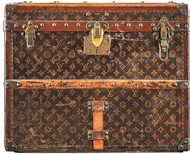
Louis Vuitton Vintage Bride's Trunk