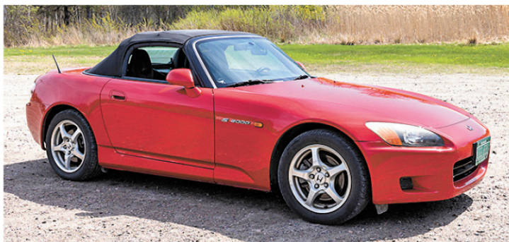
Ca. 2000 Honda S 2000 Red Convertible