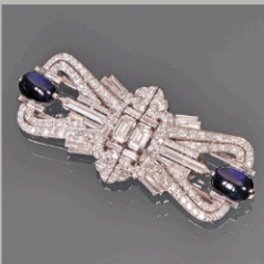
Burmese Sapphire Clip Sold $11,000