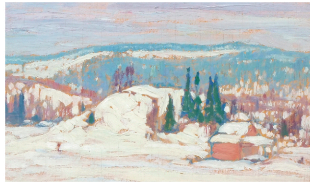
Alexander Young Jackson (Canadian, 1882-1974) Hill Country, Eastern Townships, c. 1915 Oil on board $15,000-25,000