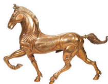
Ludovico De Luigi (Italian, B. 1933) Bronze Horse $500-1,000