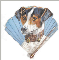
Duvellery, Paris Fan Sold $1,200