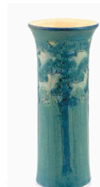
Newcomb College Studio Pottery Vase $800-1,200