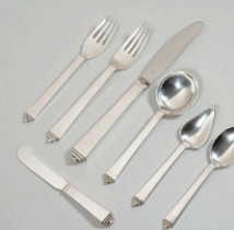
Georg Jensen Pyramid Flatware | Sold $7,000