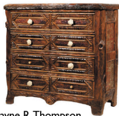
Dwayne R. Thompson Adirondack Chest $1,000-2,000