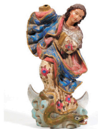
Quito School (18th C.) Polychrome Wood Sculpture | $500-700