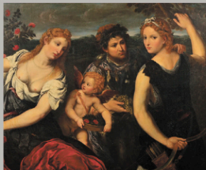
Paris Bordone (1500-1571) Sold $150,000