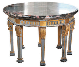
Neoclassical Centre Table Sold $625,000