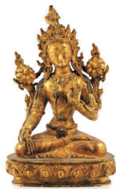
18th/19th C. Sino-Tibetan Gilt Bronze $2,000-4,000