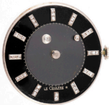
Vacheron & Constantin-LeCoultre Diamond Galaxy Mystery Dial Watch | $2,000-4,000