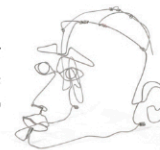
Contemporary Art Wire Sculpture $100-200