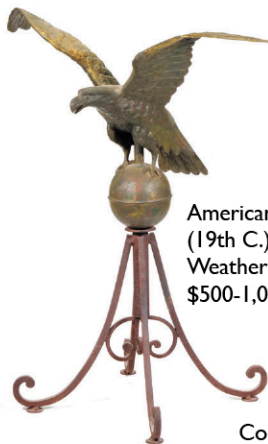
American Folk Art (19th C.) Eagle Weathervane $500-1,000