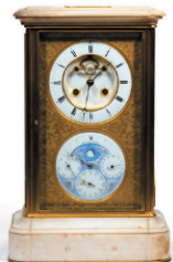
Brocot (1817-1878) French Perpetual Calendar Shelf Clock | $3,000-5,000

View the Catalog at ACES.NET Online, Phone, & Absentee Bidding Available gallery@aces.net | (475) 500-7118