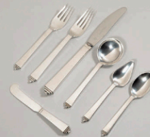
Georg Jensen Pyramid Flatware | Sold $7,000