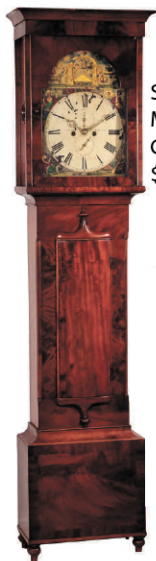
Scottish Masonic Tall Case Clock $1,000-2,000