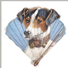
Duvellery, Paris Fan Sold $1,200