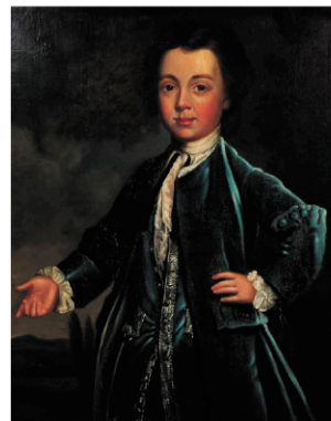
18th/19th C. Portrait of a Young Boy $2,000-4,000