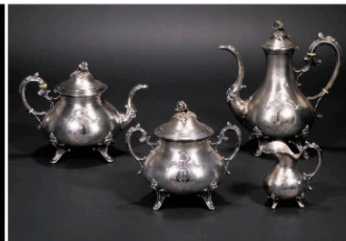
French Guilloche Sterling Tea & Coffee Service $3,000-5,000