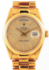
Rolex President 18k Men's Wristwatch $12,000-18,000

View the Catalog at ACES.NET Online, Phone, & Absentee Bidding Available galler@aces.net | (475) 500-7118