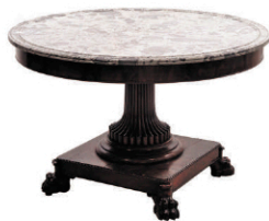
American Empire, NY Marble Top Table $800-1,200