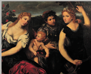
Paris Bordone (1500-1571) Sold $150,000