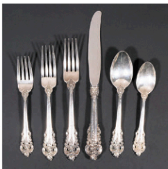
Wallace 'Grand Baroque' Sterling Flatware $7,000-10,000