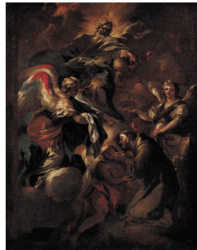
Francesco Solimena (Italian, 1657-1747) Oil on Canvas | $5,000-10,000