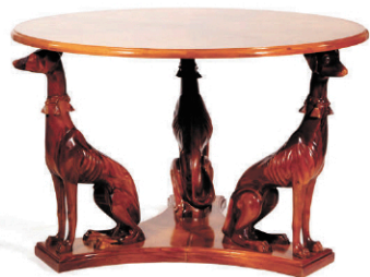
Art Deco Style 'Whippet' Carved Mahogany Centre Table $2,000-4,000