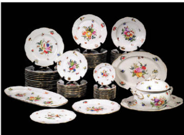
Herend Fruits & Flowers Dinner Service For 12 $1,000-2,000