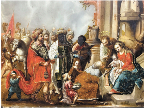
Lot 98: Oil on marble – "Adoration of The Magi"

In Person or Online at www.flannerysestateservices.com